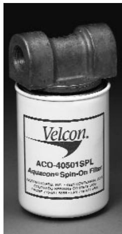
ACO-40501SPL mounted to SPH-2 Head

In fuels containing anti-icing additive (Di-EGME, FSII, Prist®), stagnant water bottoms can absorb large amounts of the anti-icing additive. This water/FSII solution can disarm water-absorbing elements allowing water to pass downstream. Daily draining of the monitor vessel and of water bottoms upstream of the elements is IMPERATIVE . Also, changeout @ 15 psid.