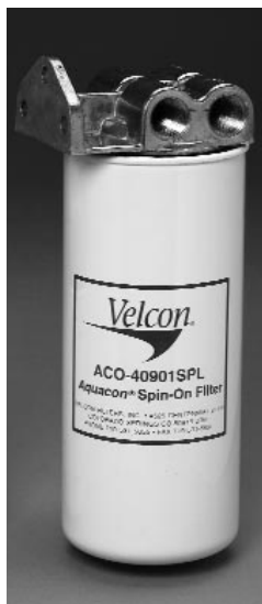
ACO-40901SPL mounted to SPH-4 Head