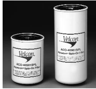
ACO-40501SPL and ACO-40901SPL