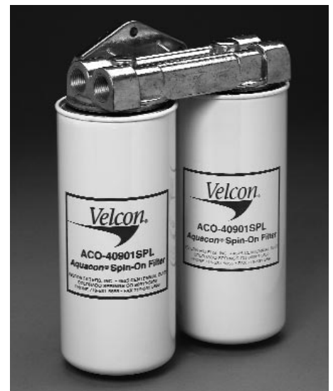
ACO-40901SPL mounted to SPH-5 Parallel Flow Head